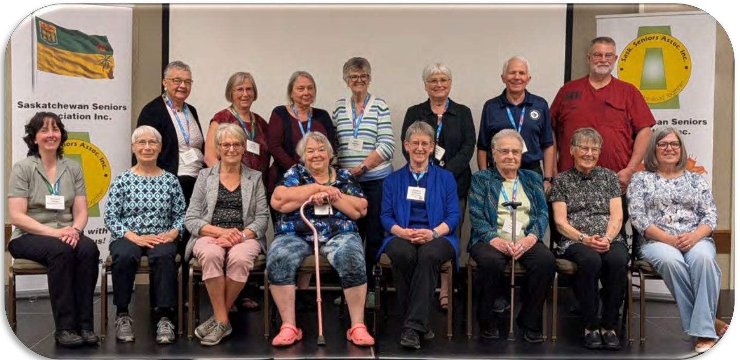
SSAI Directors & Coordinators at June 2025 Convention

9. A cautious approach can still respect autonomy - People with mental illness deserve dignity and autonomy, but governments should require exhaustive access to treatment and social supports before MAID is considered.